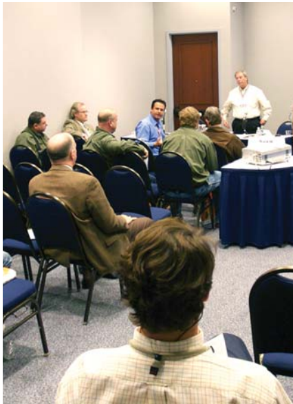
Track V-A = WaterWorks Conference (presented by the Gulf Coast Trenchless Association)